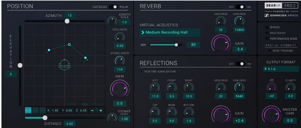
The dearVR PRO 2 graphical interface with XYZ position, early reflections, late reverb, and output sections

With true-to-life early reflections and 46 virtual acoustic presets – from a small car to a large church – dearVR PRO 2 is ideally suited for professional music and postproduction, enhancing them with an accurate perception of direction, distance, reflections, and reverb. The newly added filter modules, each consisting of a high- and low-cut filter, expand the versatility and reduce unwanted rumbling or harsh frequencies in the early reflections or late reverb section.